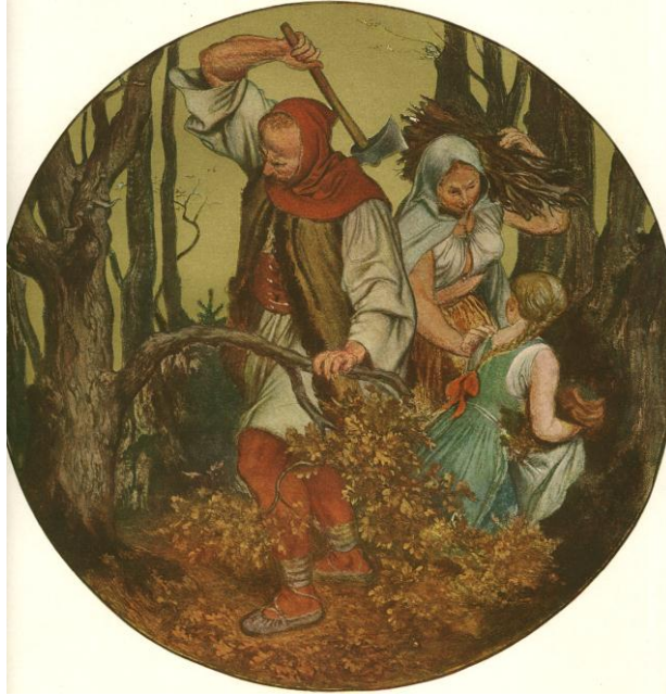
Fig. 2: Josef Mánes (1865-66): November (repro from the monograph Mánesův orloj /Mánes Astronomical Clock/ , SNKLHU Praha, 1953

Bedřich Havránek (1821-1899), disciple of A. Mánes and M. Haushofer in particular, used to be blamed for non-pictorial documentarity. Following the footsteps of his teachers, he sought romantic mountainous sceneries too, but succeeded in capturing at a level of scientific illustration the segments of "common" landscapes and woods as well. In the period of years 1854-1856, he depicted in multiple variants and by very detailed drawing a Beech Forest /Bukový les/ , giving highly valuable evidence about the sprouting capacity of beech in the surroundings of Choltice in the Železné hory Mountains. His Cottage in Broadleaved Forest /Chalupa v listnatém lese/ (1863) is standing amidst most likely a hornbeam coppice.