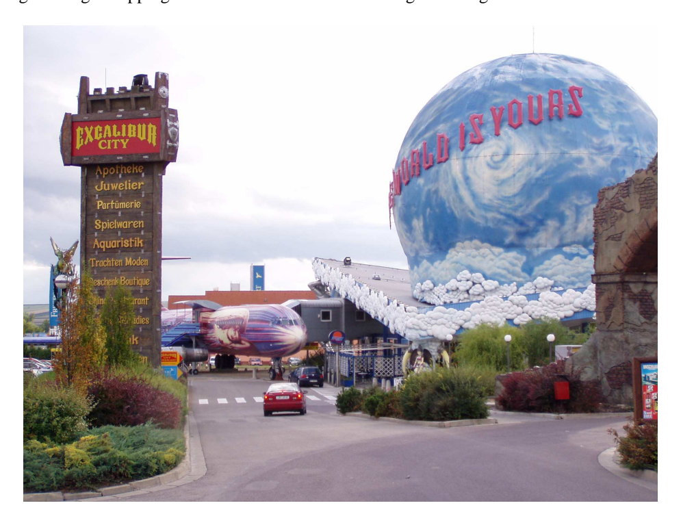
Fig. 4 Large shopping and entertainment centers damage and fragment the Green Belt