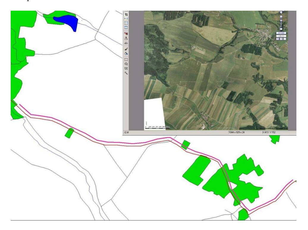
Fig. 5 Example of data sources used in the "Gap Analysis" – digital aerial orthophotographs and maps of scale 1:25\ 000

The launch of the project consists in the survey (inventory) of the current state of the Green Belt. It is facilitated by a common project methodology of mapping, which is based on visual interpretation of ortho-rectified aerial photographs images (resolution 0.5 to 3m) and terrain survey. CORINE classes, level 3, used for the land-use classification in European countries, were applied as the basis of the common classification system. The results obtained are charted in maps of scale 1:25 000. The entire information (spatial as well as attributes) is recorded in the form of GIS layers; the method ensures both their spatial analysis and their universal usability for a wide range of users (Fig.5). Currently an international information campaign has been launched within the project, dealing with the Green Belt problems and accessible both to the public and professional community.