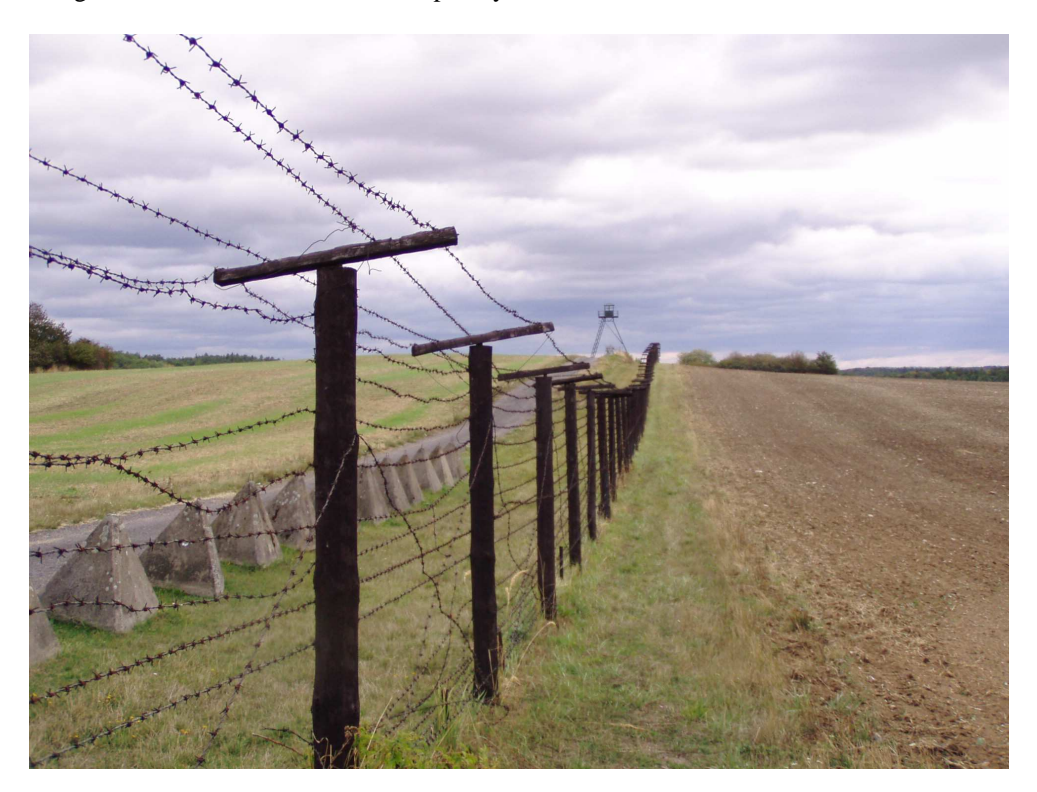
Fig. 1 The border between two completely different worlds

The "iron curtain" represented a political, ideological and also physical barrier dividing the whole of European continent. For more than 40 years it divided Europe in the long line from the Barents Sea to the Black Sea, or the Adriatic Sea. The impenetrable line consisted of wire or sheet metal fences, electric wire, minefields, self-release guns, aggressive dogs as well as armed soldiers – the line, which was referred to, concerning mainly the border in inner Germany – as the line of death. In the other countries in question it was perceived in a similar way – as a border between two completely different worlds (Fig.1). This area was practically inaccessible, almost without any use. Thus, only the nature could benefit from the existence of the border (Fig.2).